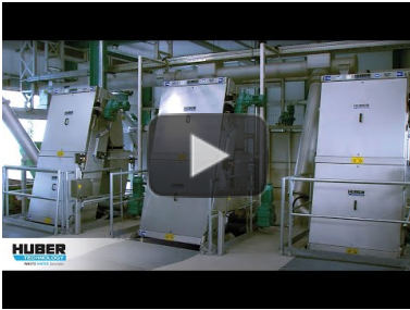
Video: RakeMax® Multi-Rake Bar Screen for mechanical preliminary wastewater treatment at a municipal WWTP

https://www.youtube.com/watch?v=SH3P8lpCDJM