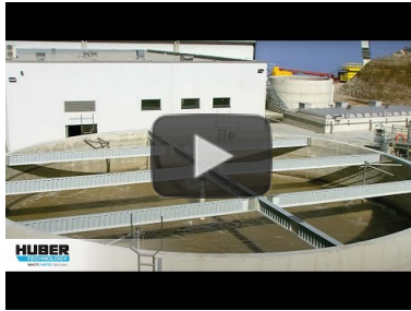
Video: HUBER RakeMax® Multi-Rake Bar Screen for coarse screening in meat processing industry

https://www.youtube.com/watch?v=SH3P8lpCDJM