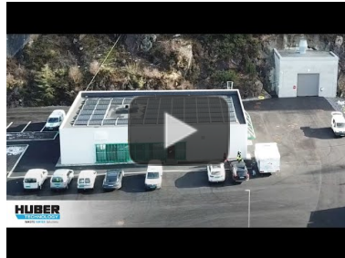
Video: Complete wastewater treatment at the Øygarden WWTP in Norway https://www.youtube.com/watch?v=KU2awn3DP68