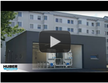
Video: HUBER Heat Exchanger RoWin in a ThermWin® Solution https://www.youtube.com/watch?v=tmifKb2QhLk