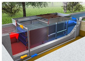
HUBER Heat Exchanger as tank version RoWinB