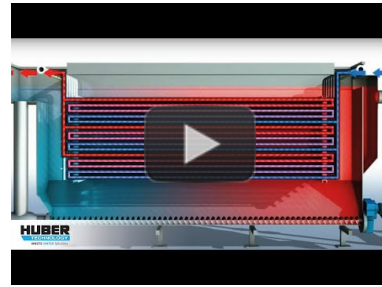
Animation: HUBER Wastewater Heat Exchanger https://www.youtube.com/watch?v=WTGBvgoUgjM