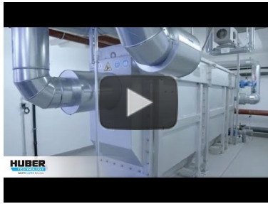
Video: Waste water heat recovery - reuse of process heat https://www.youtube.com/watch?v=JLLsLvEGFH8