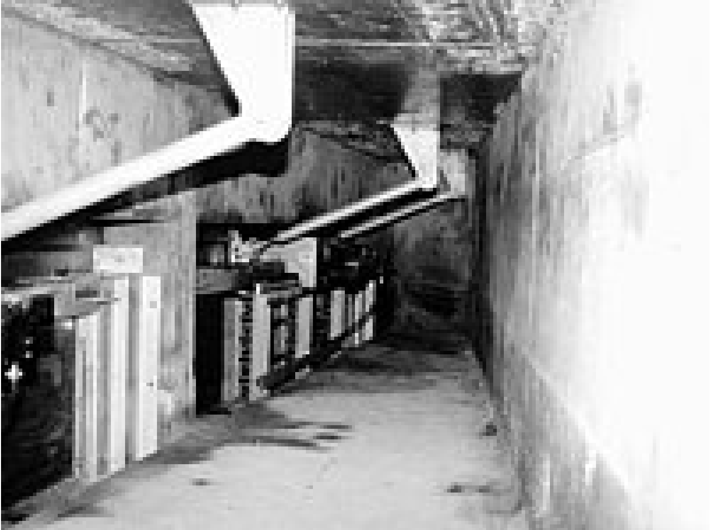
Facing adverse working conditions in the narrow building