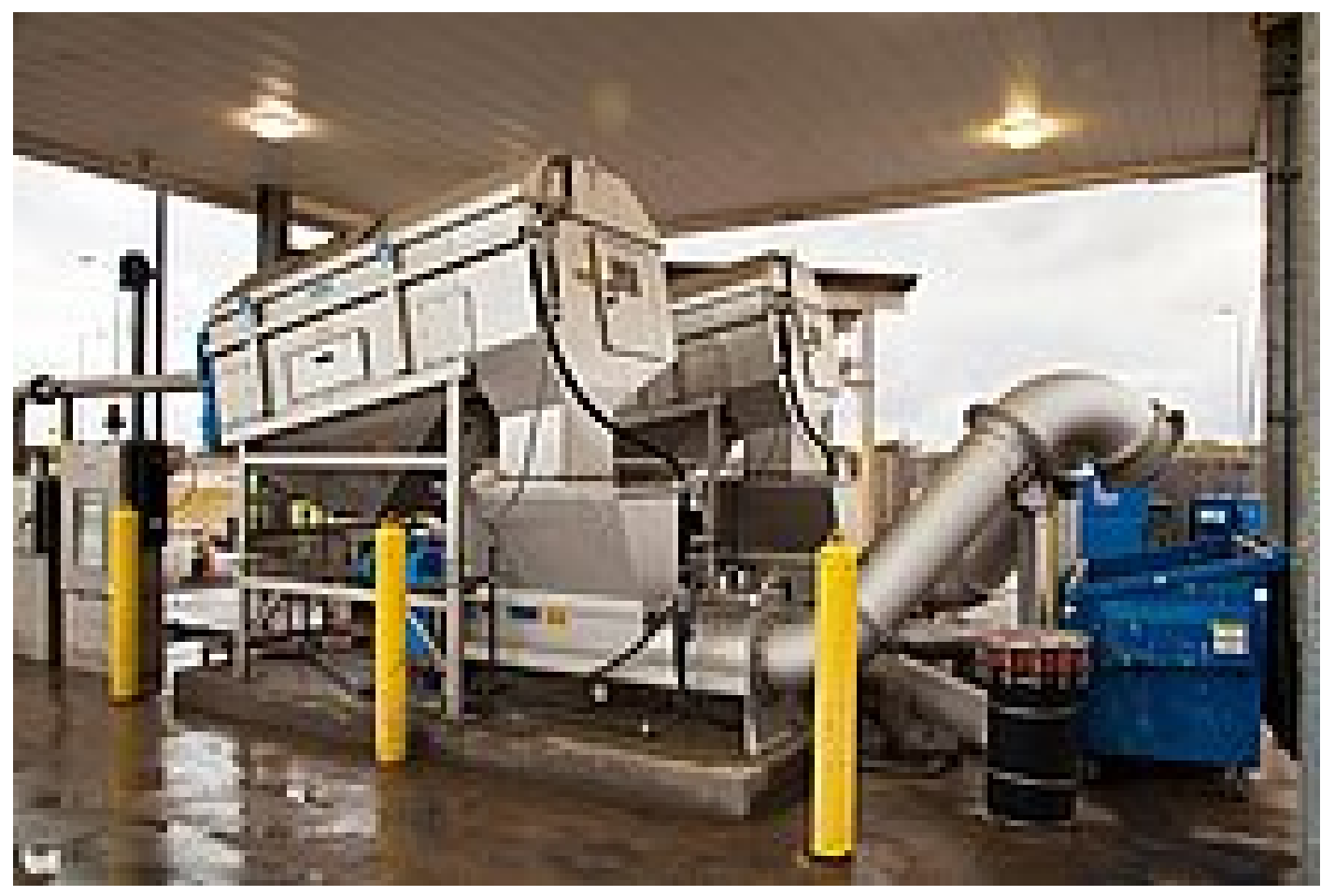
HUBER Sludge Treatment products in the San Antonio receiving station process

The San Antonio Water System had been making a homemade screen system work. It wasn't perfect – but it only seemed to fall short in keeping grit from entering their system.