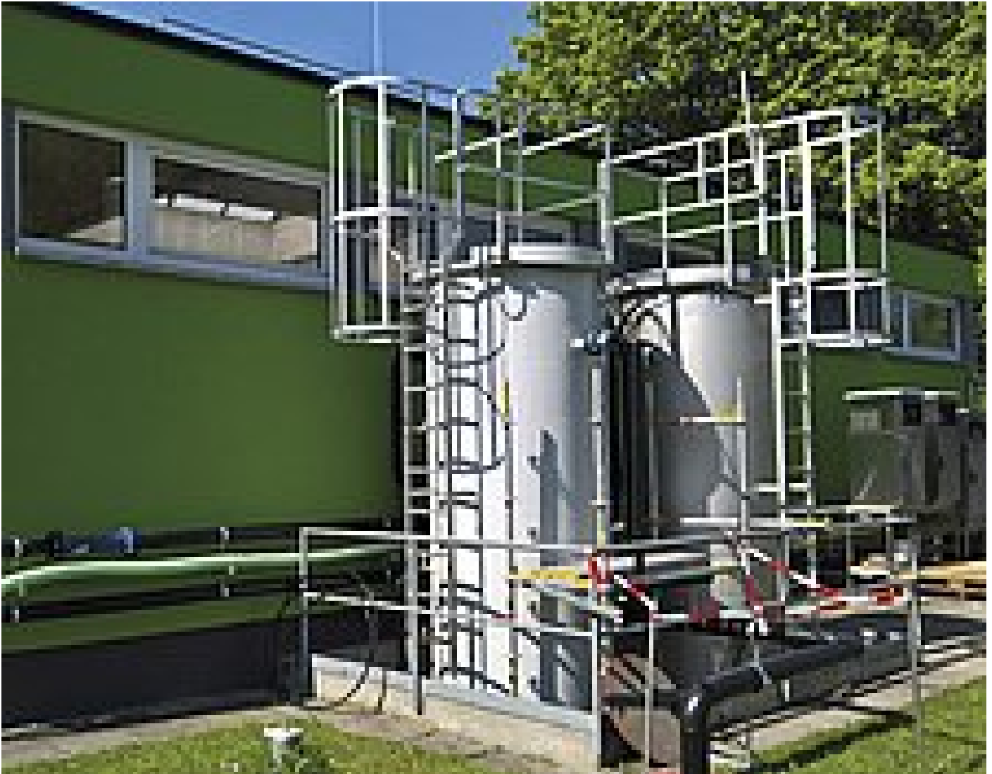
Active carbon filtration on the central wastewater treatment plant at Boehringer Ingelheim

Research project: removal of micropollutants with the use of ozone and granulated active carbon